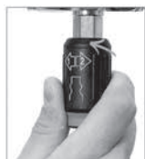
1. vents plug side